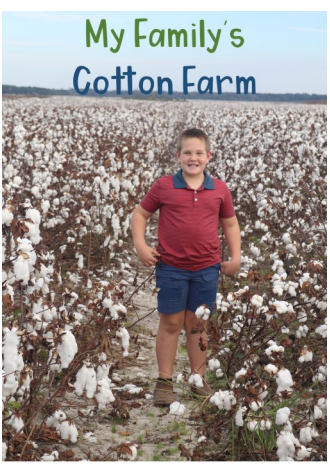
Abraham Baldwin Agricultural Gollege's Georgia Museum of Agriculture