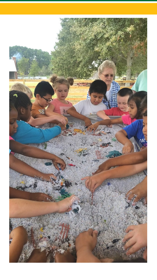
Planting Knowledge & Cultivating the Future